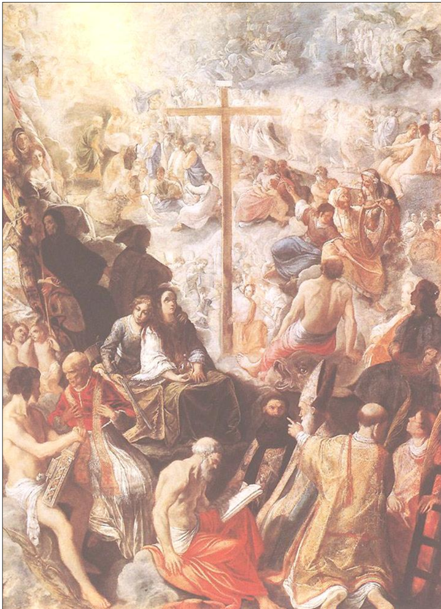
CHRIST LUTHERAN CHURCH The Feast of the Exaltation of the Holy Cross + September 12, 2021 +